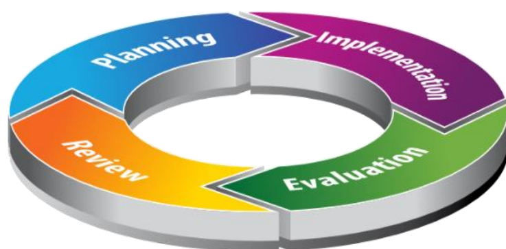
Figure 2 The EQAVET quality cycle (planning, implementation, evaluation, review).

Throughout the four phases, work package 1 (WP1): Project Management and Coordination and work package 7 (WP7): Dissemination and exploitation are of great importance for general project management and sharing the importance of the project with the rest of the world. Successfully carrying out all of the work packages is essential for completing the quality cycle and therefore for ensuring quality of the project.