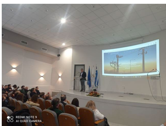
Figure 3. Photos from the launch of the MSc course "Modern Electricity Distribution Grids-HEDNO" on 21 March, 2024.