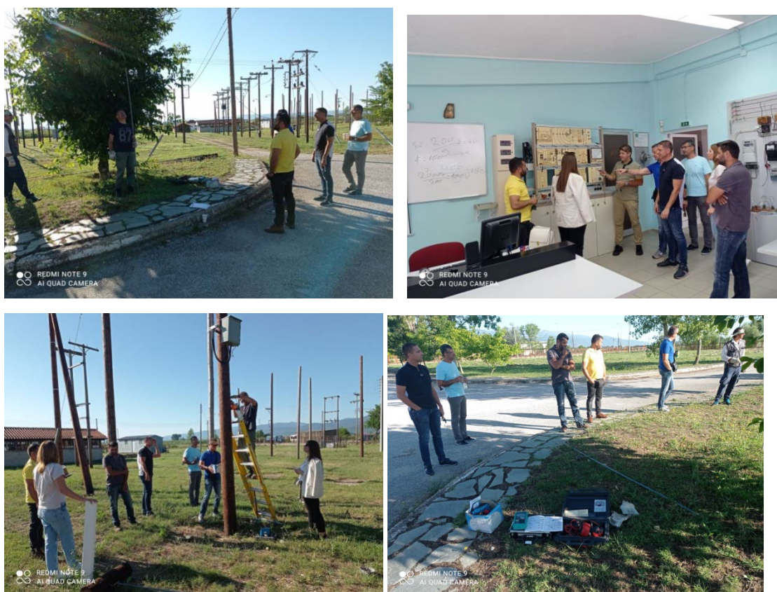
Figure 1. On- site and laboratory training

The following Figure 1 shows pictures captured during the on-site and laboratory training sessions: